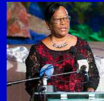
Minister for Education and Human Resource Development