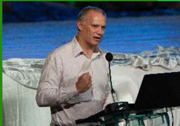
Minister for Health