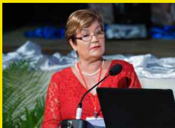
Minister for Family Affairs