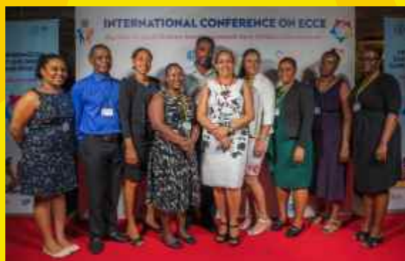
The IECD Team