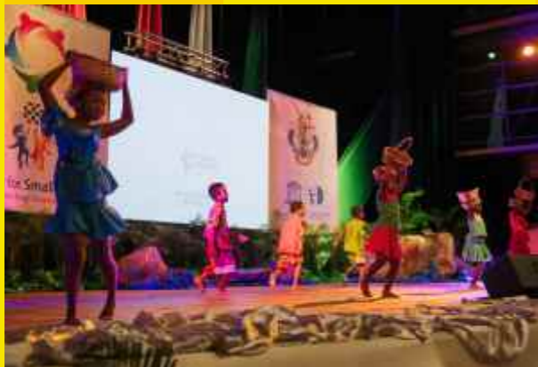
Traditional Dance performance by Beau Vallon Primary School