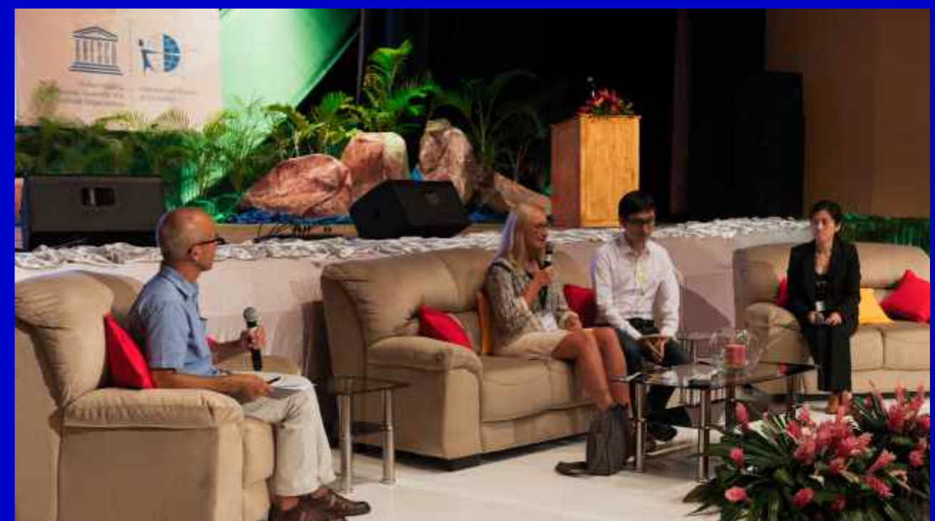
Presidential Highlighted Panel