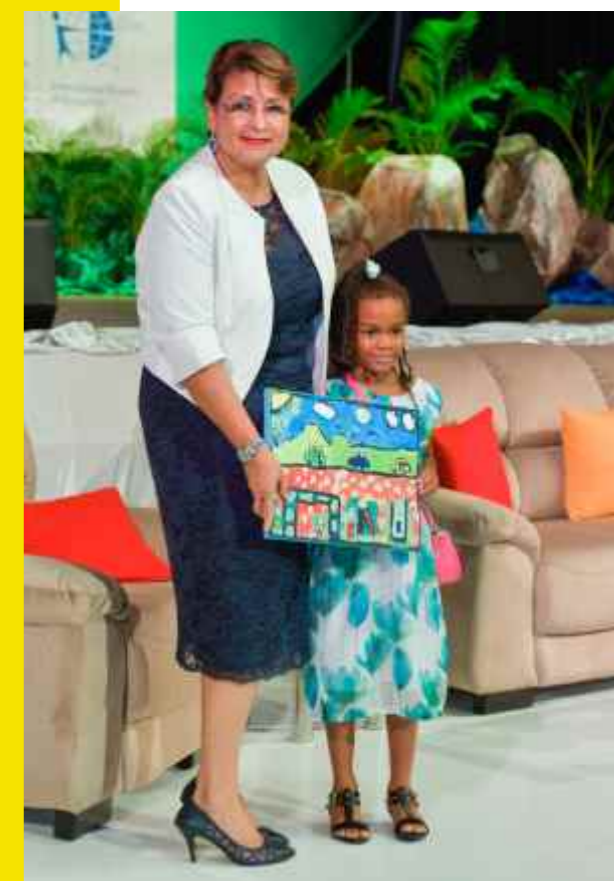
Presentation of artwork to Designated Minister