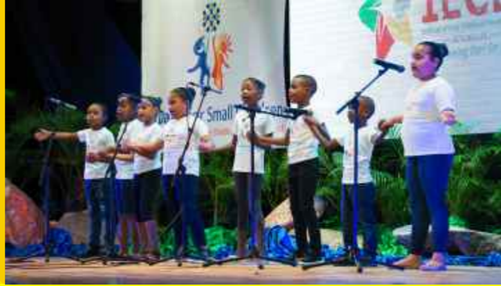
Baie Lazare School performing their winning song