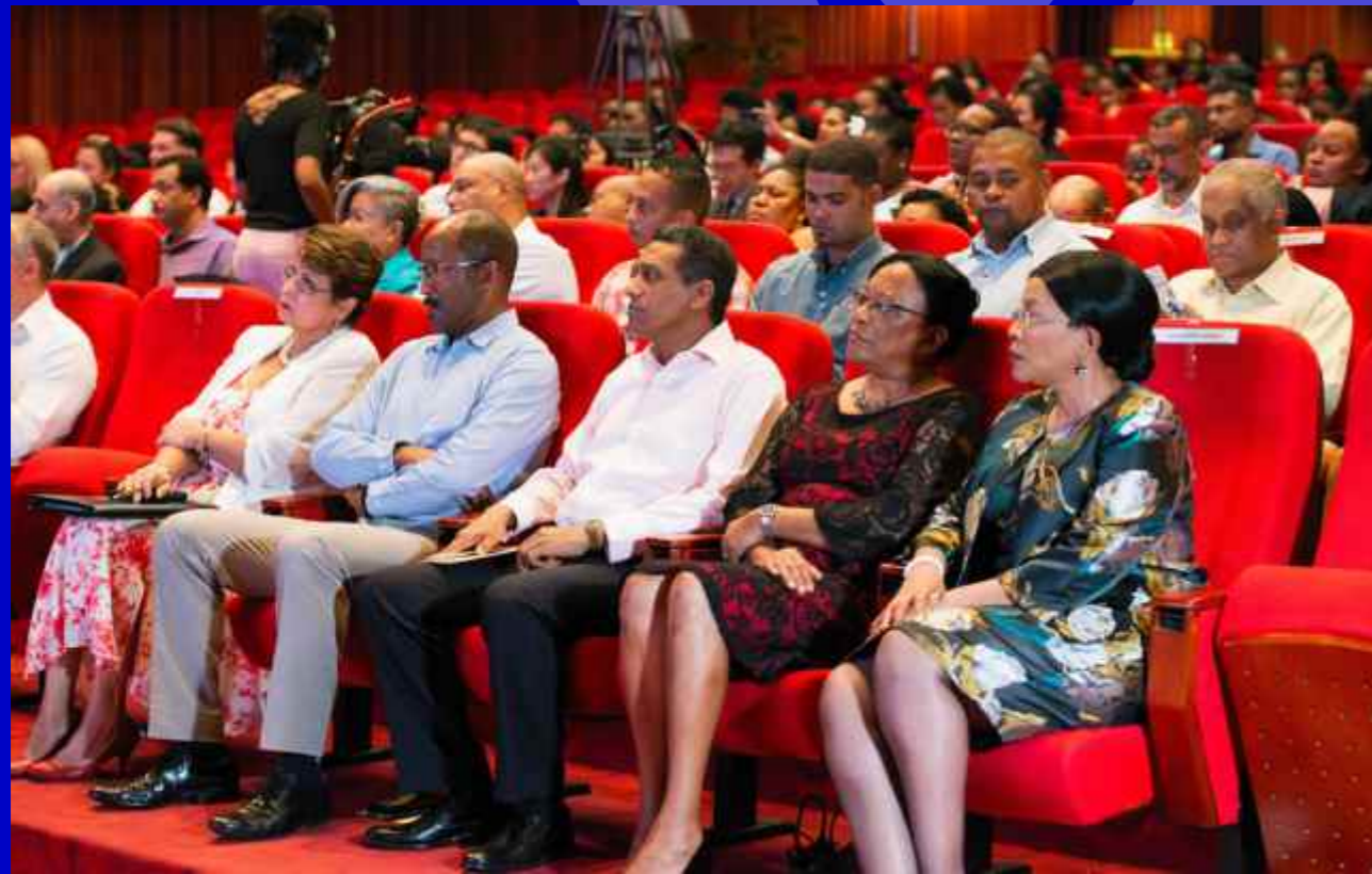
President of the Republic of Seychelles, Mr. Danny Faure, Vice President, Mr Vincent Meriton, dignitaries and delegates

The Republic of Seychelles and UNESCO's International Bureau of Education (IBE) organized and hosted the Second International Conference on Early Childhood Care and Education (ECCE) from the 21st to 23rd February 2019. Under the theme 'Big Data for Small Children-Monitoring Holistic Early Childhood Development, the conference provided practical guidance and information on how to build reliable data collection and reporting systems as a critical pillar for effective ECCE policy and programmes.