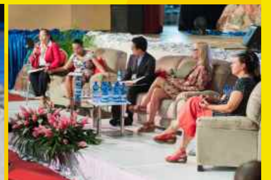
Q&A Session - Showcasing Best Practice Pillars of Resilient Systems