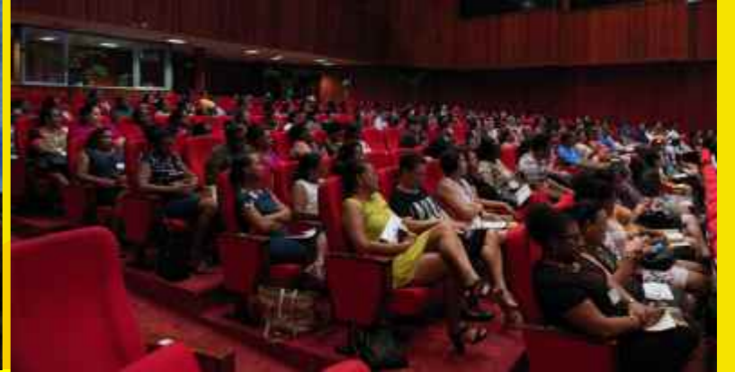
Partial View of guests attending the Opening Ceremony