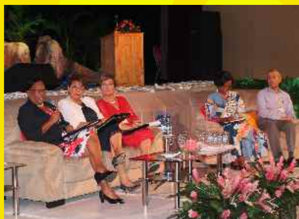
High Level Ministerial Round table