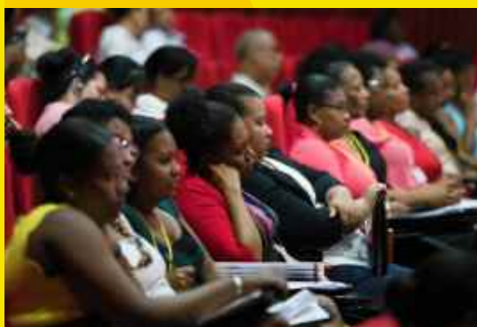
Partial view of delegates attending the conference