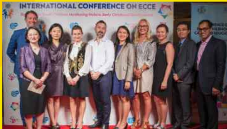
The team of experts and International Resource persons