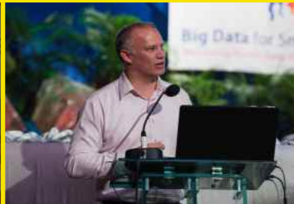
Minister Adam opening the second day of the conference.