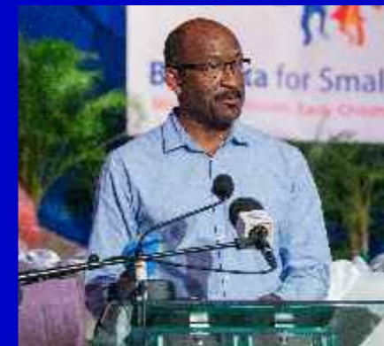
Vice President Republic of Seychelles