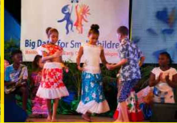
Multicultural performance by the International School Seychelles