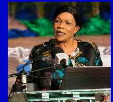
Director IBE - UNESCO