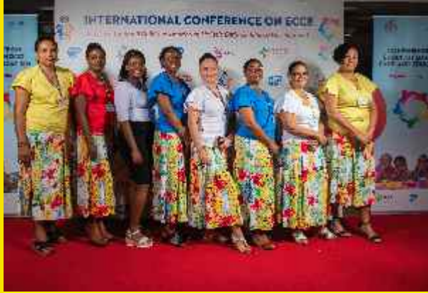
Team of Ushers from the Ministry of Health