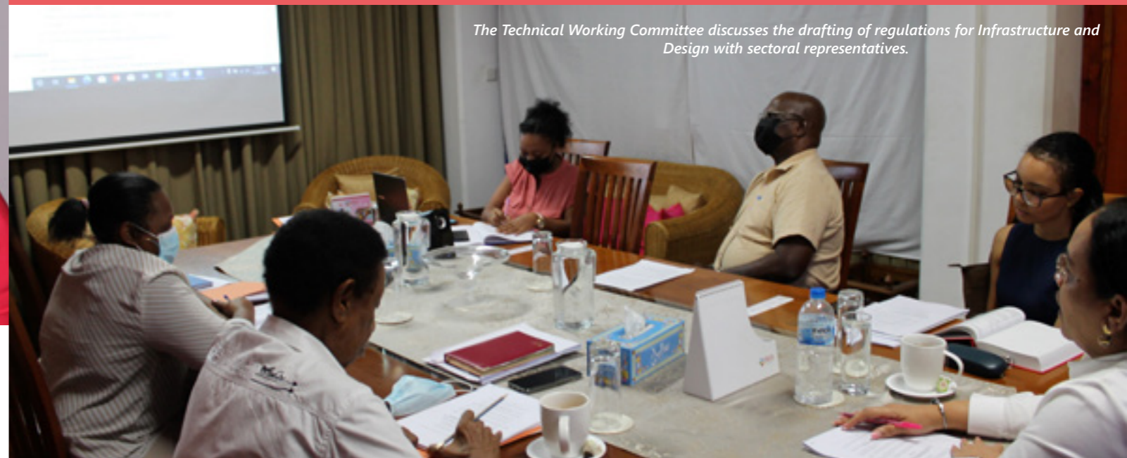
The Technical Working Committee discusses the drafting of regulations for Infrastructure and Design with sectoral representatives.

The transition and Implementation Plan for the migration of Day Care Centres from the Ministry of Education to IECD is one step closer to being fulfilled as the regulation for this category of childcare establishment is being drafted.