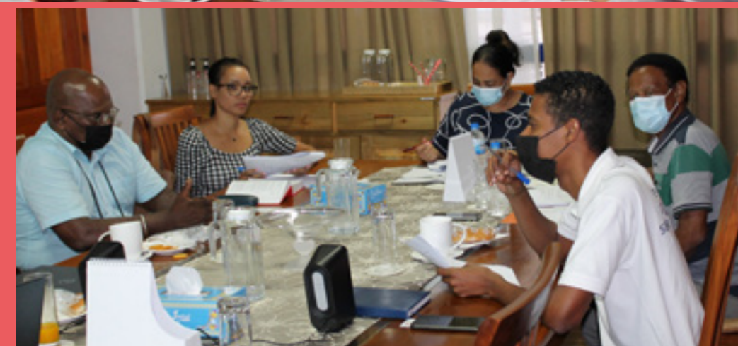
The Technical Working Committee meeting held with SFRSA representative

Working on this crucial step is the Technical Working Committee of the National Standards of