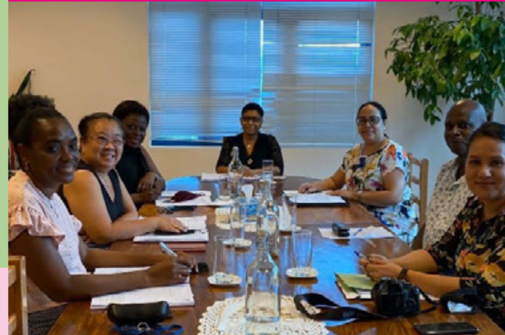
The IECD project team meets with the Social Affairs' management team to organise the Situational Analysis