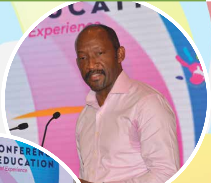
Opening address by the Vice President