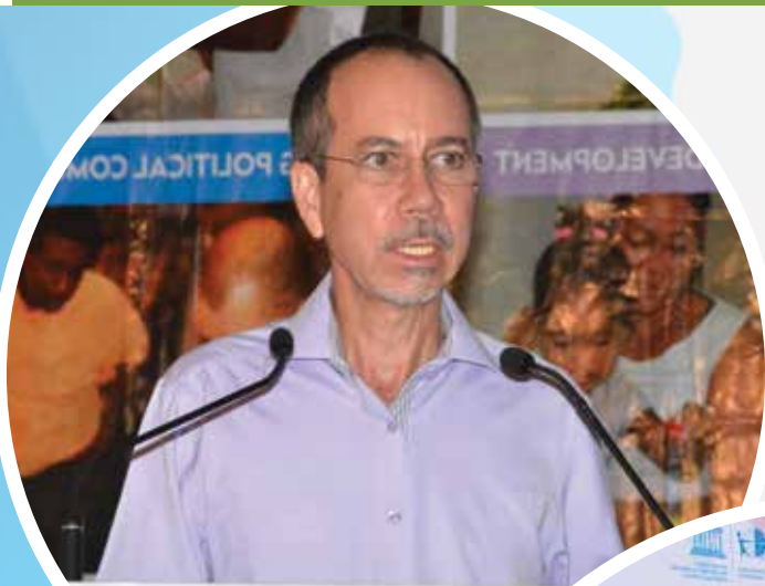
Minister Morgan delivering his address to launch of the Best Practice Hub