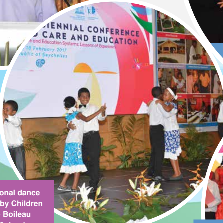
Lively traditional dance performance by Children from Anse Boileau Primary School