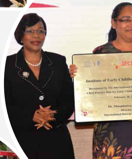
The surprise handing over of the Best Practice Plaque to CEO of the