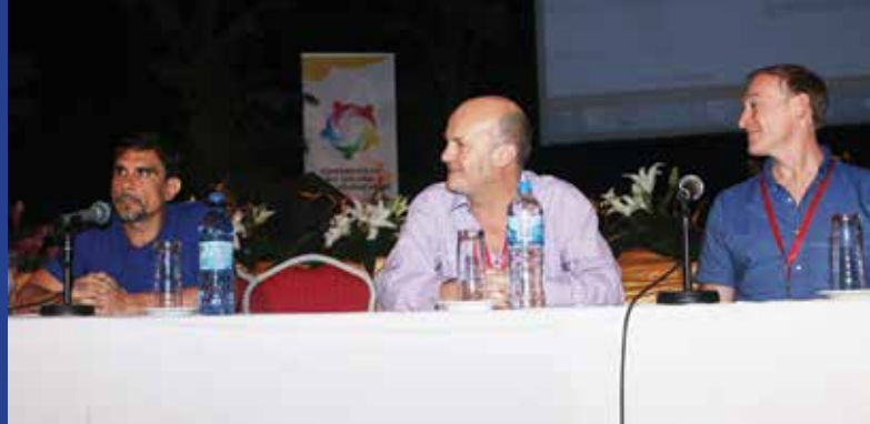
Highlighted session with the Neuroscientists