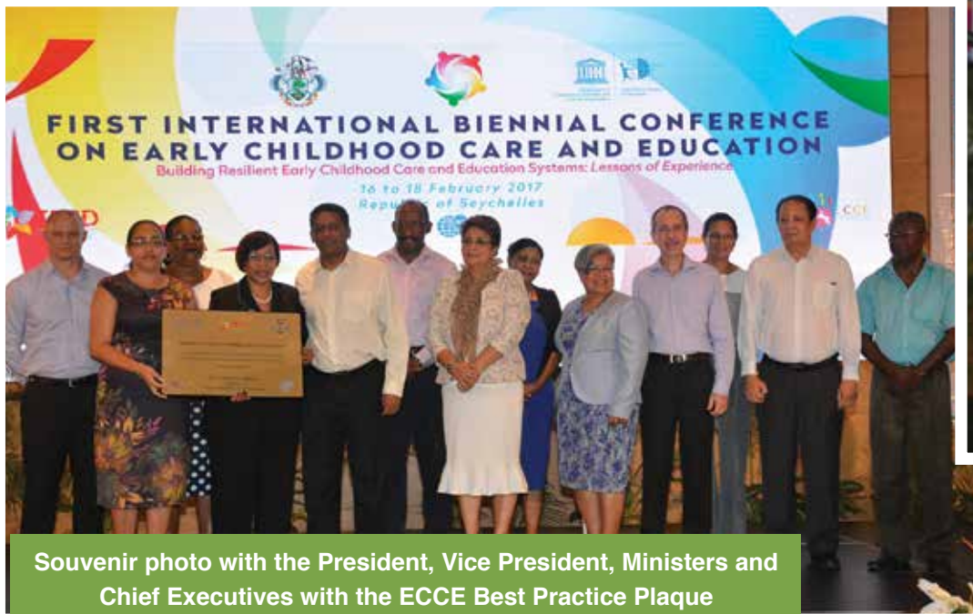
Souvenir photo with the President, Vice President, Ministers and Chief Executives with the ECCE Best Practice Plaque