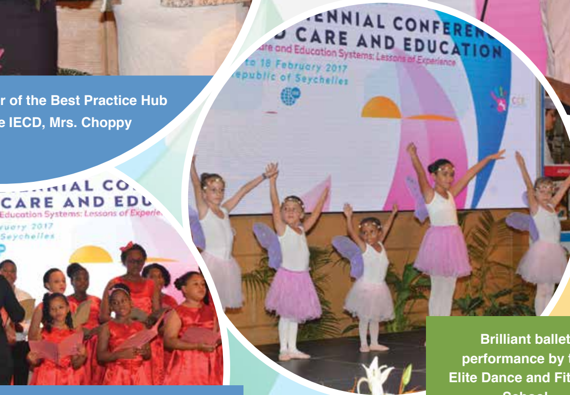
Brilliant ballet performance by the Elite Dance and Fitness School