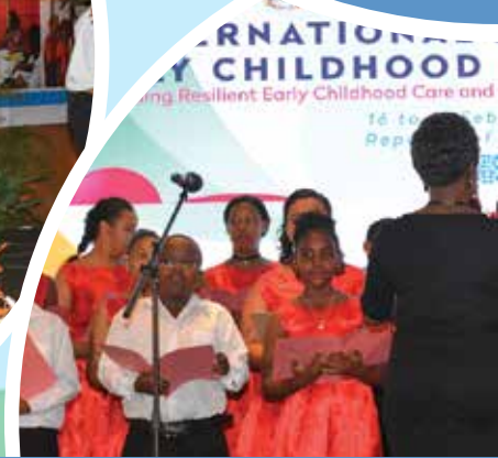
Beautiful performance by the