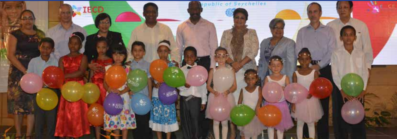
President of the Republic of Seychelles, Mr. Danny Faure, Vice President, Mr. Vincent Meriton, distinguished guests and children