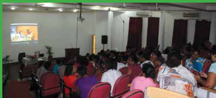
Teachers ready for the informative session