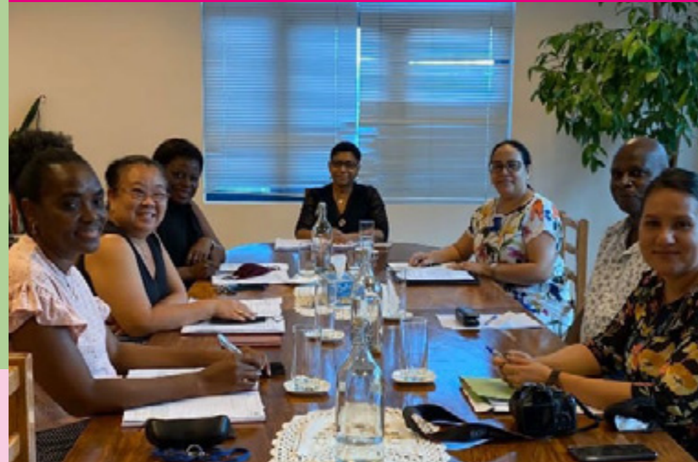
The IECD project team meets with the Social Affairs' management team to organise the Situational Analysis