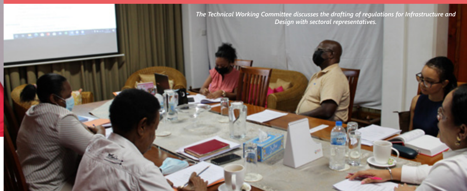
The Technical Working Committee discusses the drafting of regulations for Infrastructure and Design with sectoral representatives.

The transition and Implementation Plan for the migration of Day Care Centres from the Ministry of Education to IECD is one step closer to being fulfilled as the regulation for this category of childcare establishment is being drafted.