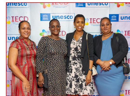
Members of the Ministry of Health's ECCE Technical working group