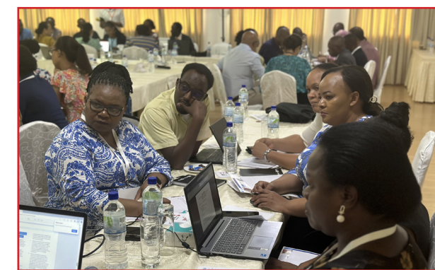
Group work - discussions on the way forward for Africa