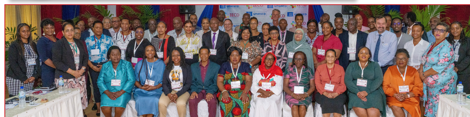
Delegates' souvenir photo