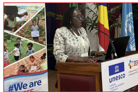
Delegate from Kenya making a presentation during the workshop