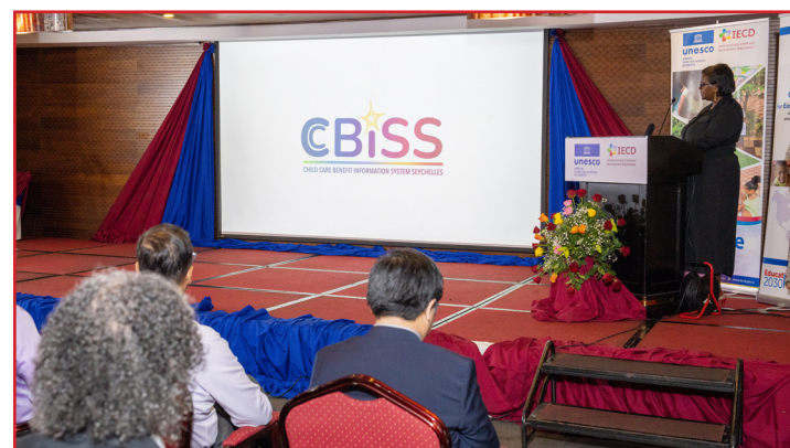
Official launching of CBISS - IECD's online platform for financial assistance