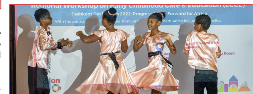
The Anse Boileau primary entertaining with a cultural dance performance